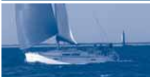
Sun Odyssey 39i Performance