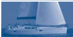
Sun Odyssey 39i