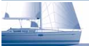
Sun Odyssey 42i